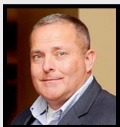
Sheriff Craig Peavy